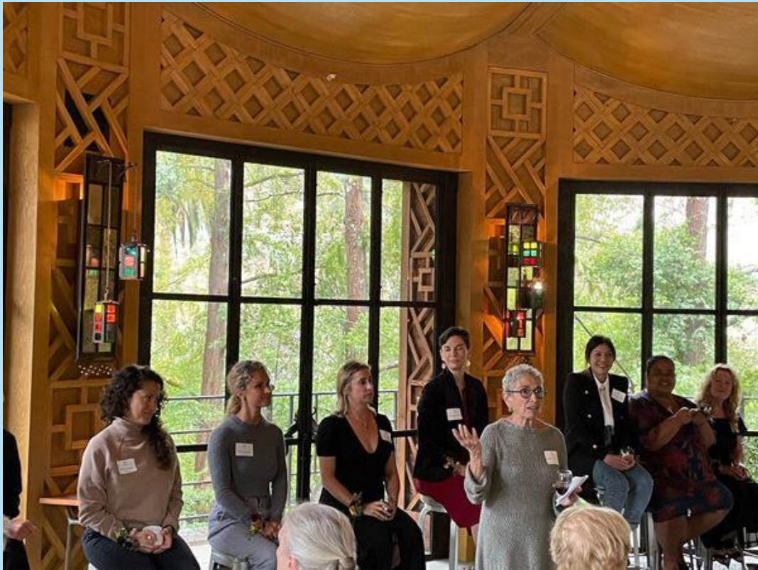
Induction 2022