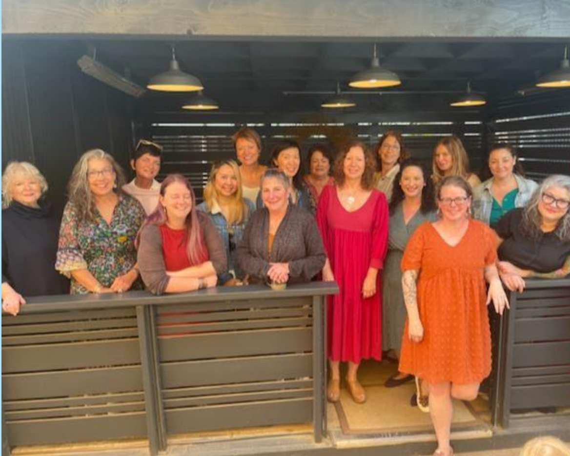
SF and Sonoma chapter dames gather at Valley.

members alternatively at the tables to encourage new connections. We brought a few prospective members as well. These meet ups are a great way to help with the membership campaign.”